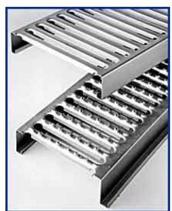
9" x 18 Gauge Loads and Deflection

---Distance between Supports (Feet)-25 3 35 4 45 5 55 6